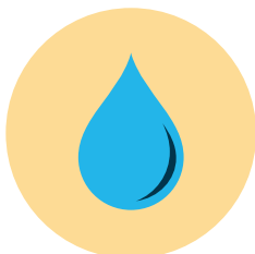
Rain and Floods

Inorganic and breathable - resistant to mould growth. May need protective layer.