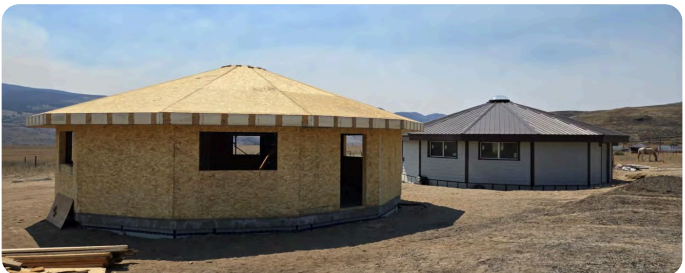
Dodeca-Home under construction.

The structural integrity of a pit house may be improved through tying the roof to the walls with anchors and/or the addition of steel and concrete rods.